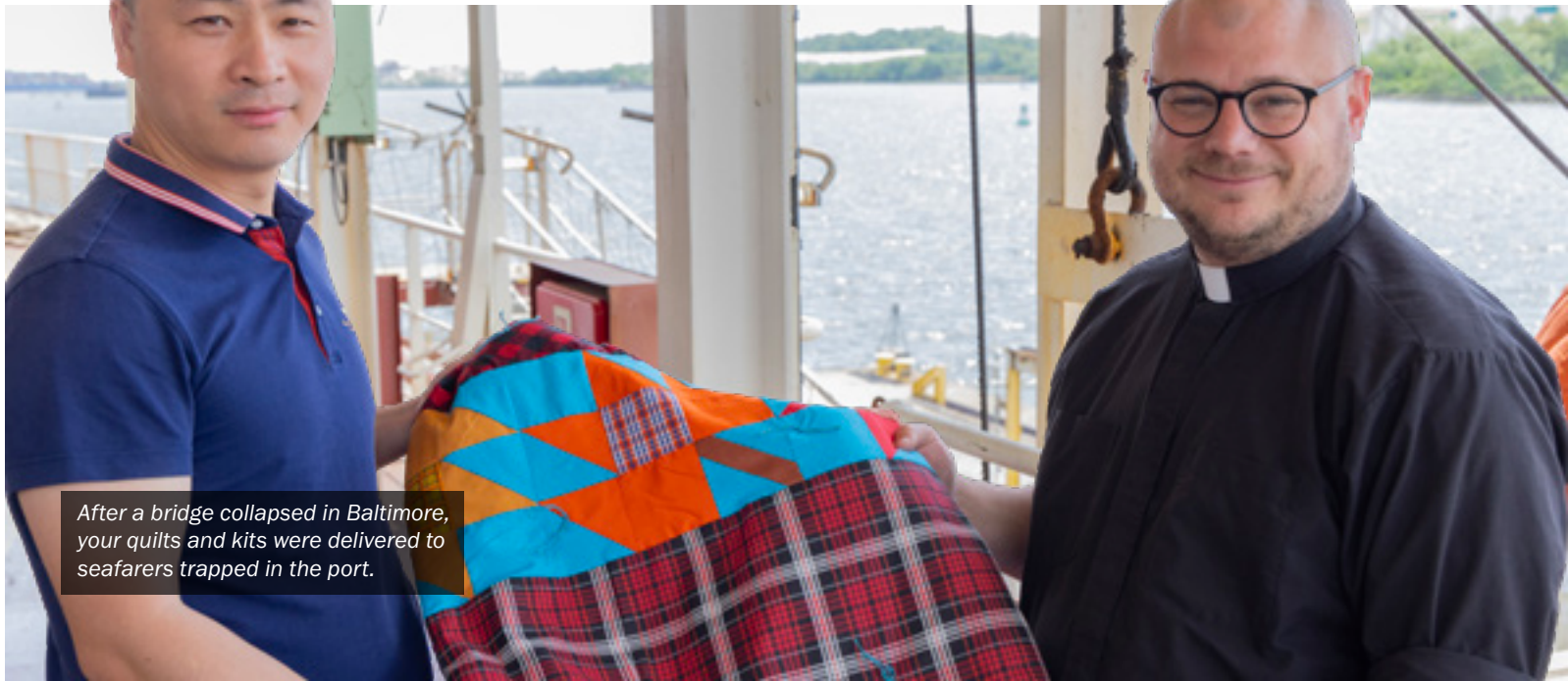
After a bridge collapsed in Baltimore, your quilts and kits were delivered to seafarers trapped in the port.

Be sure to visit lwr.org/quilts and lwr.org/kits for resources to make your quilting or kit-making project a success!